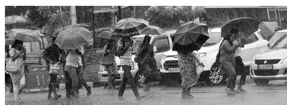
SHOWER SEASON Monsoon from June 1 to August 22 (in millimeters)

After pounding Kerala and other southern states, the southwest monsoon is now expected to become active over states such as Uttar Pradesh, Bihar, Jharkhand, Odisha, and West Bengal, till August-end, and then over central India. In its latest weekly update, the India Meteorological Department (IMD) said the rains would become active over east India and parts of central India due to the influence of a low pressure area likely to formed over the Bay of Bengal. "The rains have revived over some parts of east India and around August 26, a fresh low pressure area will form over the Bay of Bengal. Though not very strong, it will bring rains over central India and parts of the west coast," said Mritunjay Mohapatra, additional director general, IMD. He said in the southern peninsula, rainfall intensity would gradually peter out. The region, according to the IMD's latest weekly bulletin, has received around 81 per cent excess rainfall during the August 16 to August 22 week. This was due to the deluge in Kerala along with parts of Karnataka. The revival of rains over eastern and central India over the next few weeks should augur well for the standing kharif crops, which were facing moisture stress due to a prolonged dry spell. "So far, the monsoon distri-